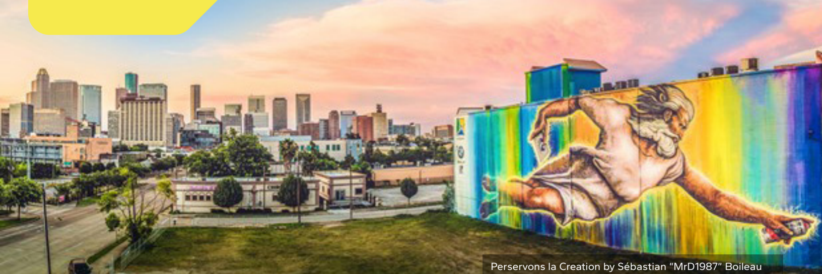
Perservons la Creation by Sébastien “MrD1987” Boileau